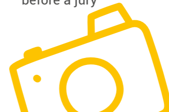
Art degrees within the LMD system

> By facilitating admission without an entrance examination and without having to appear in person before a jury